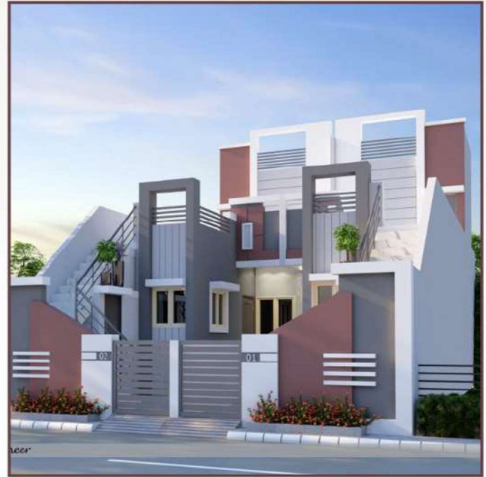
TYPE - B