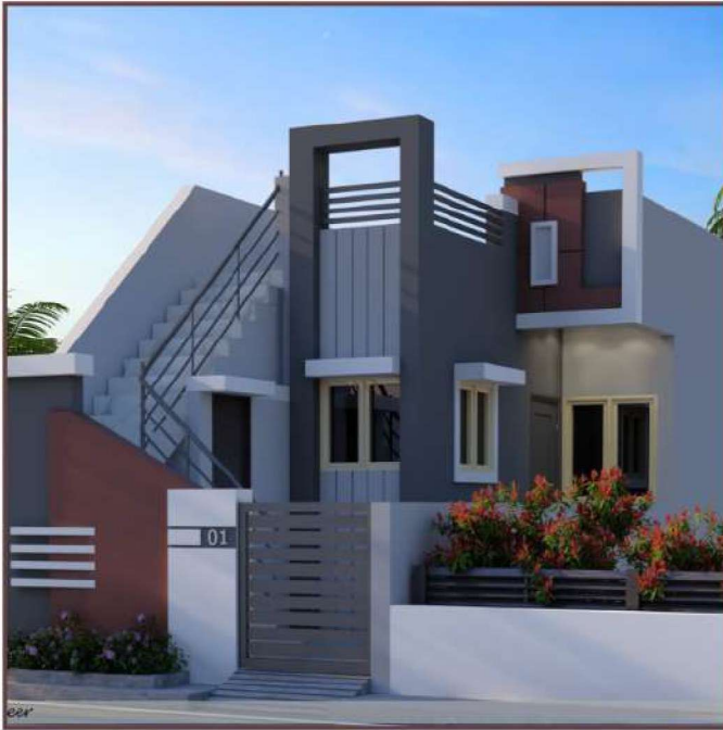
TYPE - A